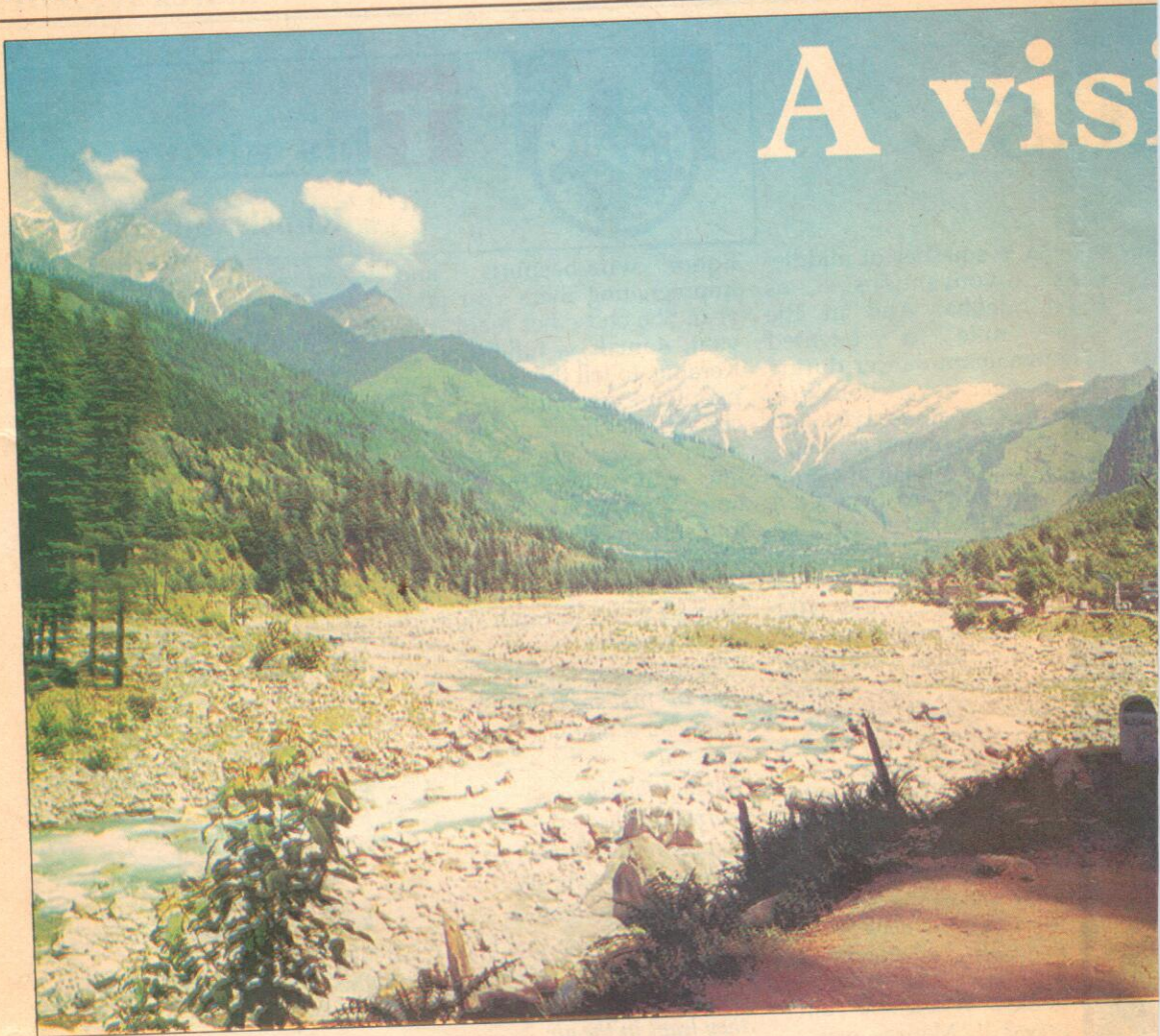
The route from Naggar to Manali is breathtakingly beautiful

C OME summers and holidays and a visit to a hill station can't be far behind. It has become customary to go to a hill station during the summer season to beat the heat and escape the lethargy that bogs you down. A visit to the hills offers an attractive package comprising picturesque locales and clean air. Who wouldn't be tempted by such scenic destinations, be it Mussoorie, Shimla, Nainital, Dalhousie or Kulu-Manali?