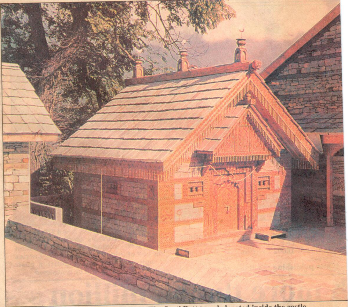
The Jagti Patt temple located inside the castle